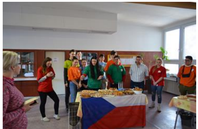
Tasting the cultures.