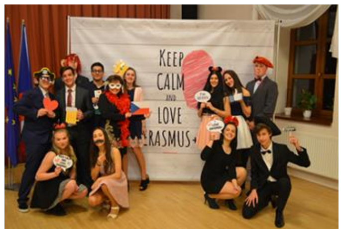
Farewell dinner and activities.