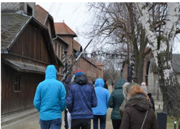
Visiting the place of Human tragedy.