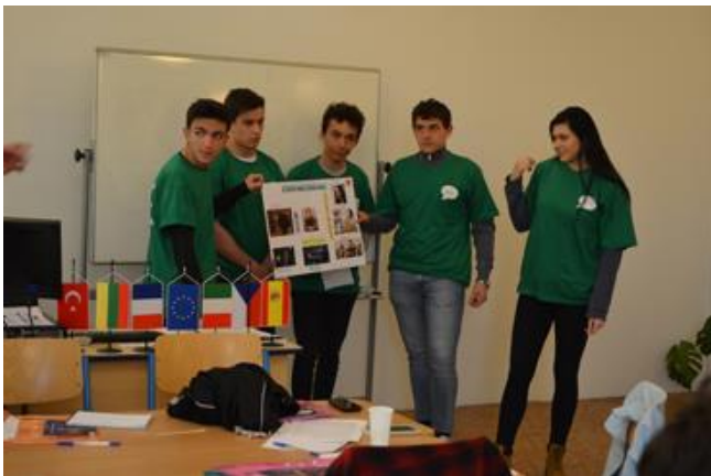
Working in an international team.

I liked the sightseeing because I love when I can talk about places that I know or I know something interesting about them. But the most interesting thing was our visit to the Auschwitz Museum in Poland. It was a bit sad or even shocking but I think the history needs to be taught so we as humankind can learn from our mistakes we made in the past and this was one of them. But the best thing was the free time when we went somewhere and we were talking with each other for few hours and I think everyone liked it because there were no teachers and we had total freedom.